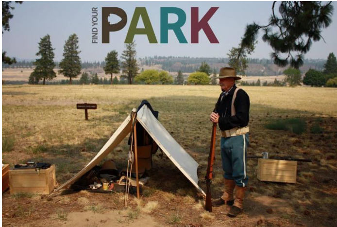
Frontier Regulars set up their historical reenactment camp in front of Fort Spokane Visitor Center.