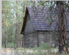
LARO preserves historical sites, like St. Paul's Mission

In recent years, the NPS has grown to oversee over 400 sites, and more than 45 million acres, in all 50 states. As the NPS grew, so did its overall mission; the National Park Service is now a world leader in environmental health, parks and preservation, cultural preservation, and pioneers in protecting America's Open Spaces.