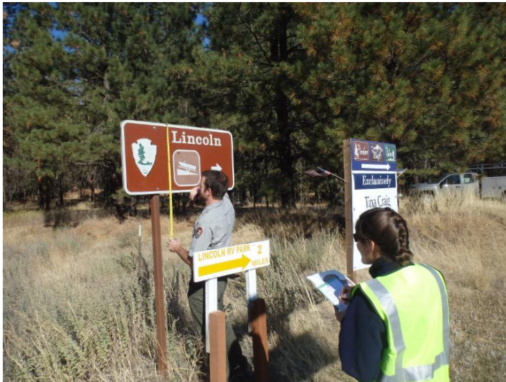
All Employee Sticker Day.

As a part of our centennial goals at LARO, we want to raise visibility of our logo in the surrounding communities. We started this effort on September 29th with our All Employee Sticker Day by posting new NPS logos on park signs. This gives visitors an easy way to identify our park locations and our affiliation with the National Park Service.